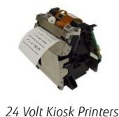
24 Volt Kiosk Printers