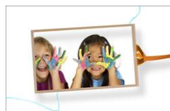
Multi-Input Touch Panels